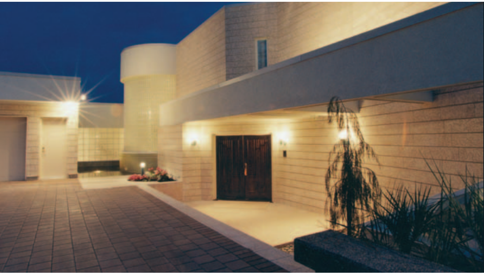
■ SAWN FACE: sawn face finish, sawn top & bottom beds, buff colour, single course 190mm ( 7 ½") home, garage and steps.