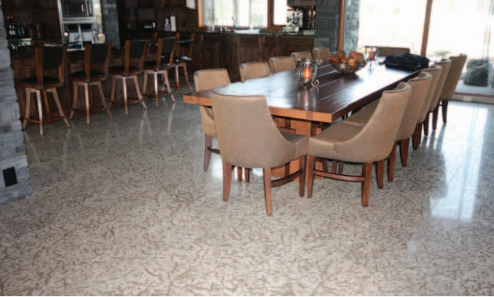
Above, Below, Right: Interior flooring with Tyndall Stone® Tile, 297mm x 597mm x 10mm thick, honed finish, grey colour.